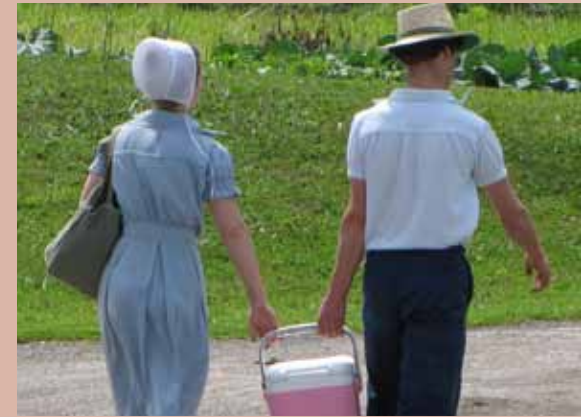
Fig Tree Bulk Food Store – While visiting this bulk food store have the opportunity to purchase those "hard to find items" at a great price. The customers often say "They have every ingredient I need, and they even have ingredients I didn't know I needed".

Country Art's & Jewelry – Visit a store like you have never seen before! Native American Artifacts, South Dakota Gold & Sterling Silver, gifts, sage, incense, soaps & oils and a lot more at very reasonable prices. Something for everyone!